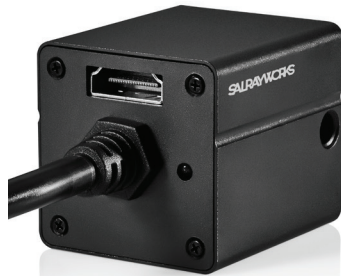
Rear Side ( HDMI Out )

Communication : RS-422, RS-485/ PELCO-D/P, VISCA Operating temperature : 0°C ~ 50°C Weatherproof : IP67 Power : 12VDC(7V ~ 15V) Power consumption : Max. 3.6W Dimension : 143 x 43 x 60 mm (W x H x D) Weight : 380g